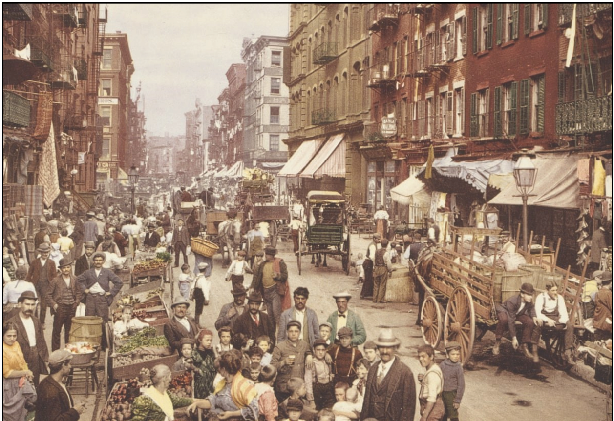
MULBERRY STREET, NEW YORK CITY, CIRCA 1900

IN 1994, CASA MIA WON HUNT-WESSON FOODS PRIMA PIZZA RECIPE CONTEST, OUR FIRST NATIONAL PIZZA AWARD. SINCE THEN WE HAVE BEEN AWARDED FIRST PRIZE IN THE "PIZZA ACROSS AMERICA" CONTEST, AND HAVE TWICE WON PIZZA TODAY MAGAZINE'S PIZZA FESTIVA INTERNATIONAL PIZZA RECIPE CONTEST.